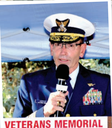
ETERANS MEMORIAL CENTER & COUNCIL