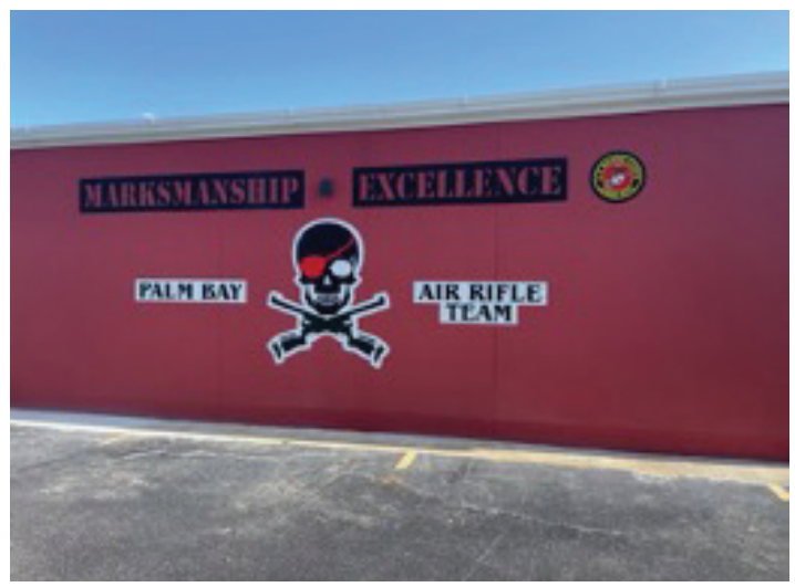
Outside view of the new Rifle Range