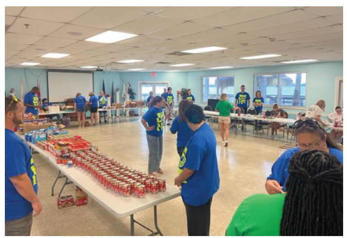
Two organizations making the work go quickly

For several years the Good Deeds Foundation has been supporting a unique organization called OASIS by providing postage funds. At the Veterans Memorial Center, with several MOAACC members involved, on 22 July OASIS packed and prepared for shipment Halloween Goodie Boxes to troops deployed overseas. Almost 50 people from the OASIS and Elevation Church came to donate, help pack and include hand written letters for more than 150 boxes. For the past five years OASIS has used the VMC for one of their annual missions of about 5 per year to bring morale and goodies to troops without family serving abroad. Elevation Church has donated huge numbers of people for landscaping work in the Plaza area and the Park for almost two years and purchased more than $15,000