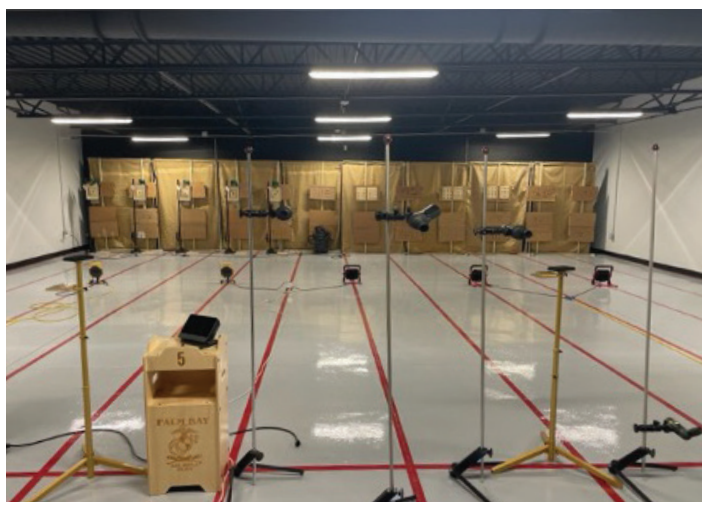
Over the summer vacation Brevard Public Schools built a $100k building for the Marine JROTC program which will become the home for meets for Air Rifle Competition for all JROTC teams in the county.