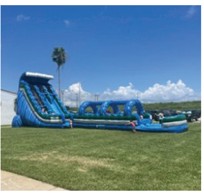
Children having fun on the giant water slide at USCG-Station