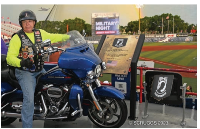
POW/MIA Bench before the storm.

Most who attended were very pleased by the flexibility that the ceremony was not affected by the summer evening Florida weather. The participants repeatedly noted how much it means for the military and veteran community to have the support of the USSSA staff and the USSSA Pride Team.