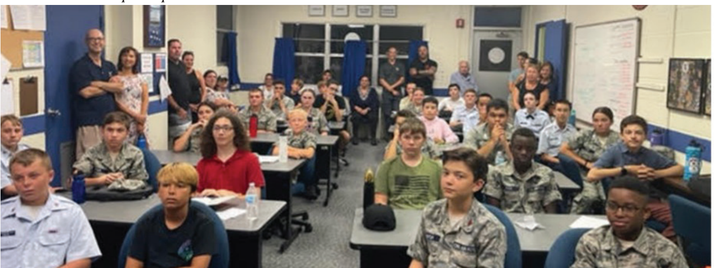
Patrick Composite Squadron and parents, CAP leaders