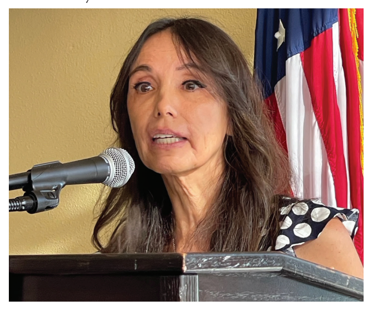
MOAACC